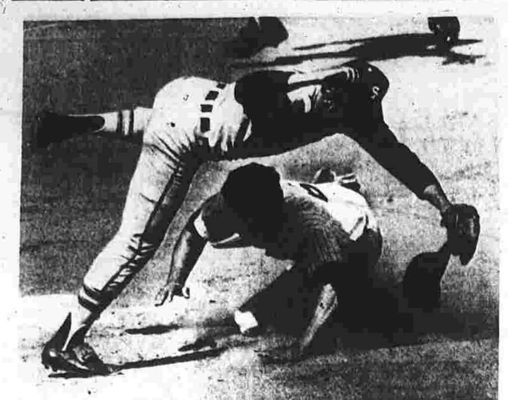
FLYING HIGH—White Sox shortstop Luis Aparicio had to jump over a sliding Roy White of the Yankees in this fast action at second base yesterday.