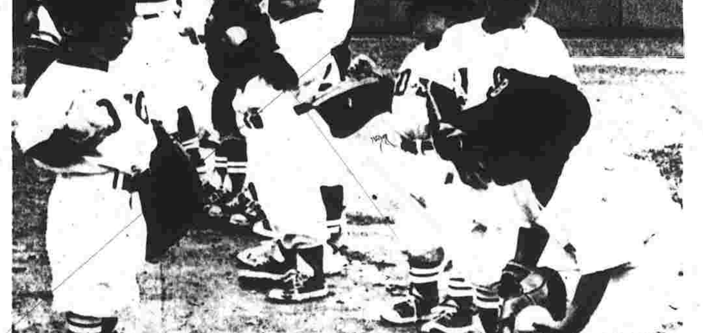
O.K. GANG, LET'S GO—Spokesman for the sons team took the field to play against their fathers in annual Fathers-Sons game at Fenway yesterday.